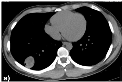
Fig. 2. Chest CT scan